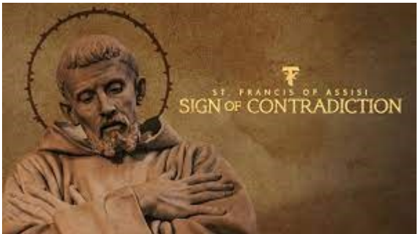
Francis was a person who, like us, searched for purpose and meaning and was oftentimes left empty. It wasn't until he encountered Jesus Christ that his darkness and confusion were replaced with light and peace. When the world saw him as a fool, he stood as a sign of contradiction. Ultimately, this film is about conversion: his and ours.

Eleven young men from the United States walk 1,000 kilometers on their Way of St. James pilgrimage. They are looking for answers, not beautiful scenery: How do you deal with pain and suffering? Do the weak quit or do they find meaning on the Camino? How much bag-gage is enough or too much?