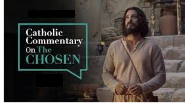
Catholic Commentary on The Chosen aims to help Catholics actively engage with the immensely popular TV series depicting the life of Christ. Now available into Season Three.

There are so many wonderful options on FORMED, and it's FREE! Go to stviatorparish.formed.org to sign in. Follow the prompts to get yourself started. Under find your parish - St. Viator Parish Dauphin