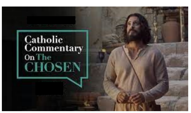
Catholic Commentary on The Chosen aims to help Catholics actively engage with the immensely popular TV series depicting the life of Christ. Now available into Season Three.

There are so many wonderful options on FORMED, and it's FREE! Go to stviatorparish.formed.org to sign in. Follow the prompts to get yourself started. Under find your parish - St. Viator Parish Dauphin