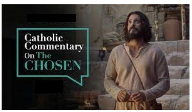
Catholic Commentary on The Chosen aims to help Catholics actively engage with the immensely popular TV series depicting the life of Christ. Now available into Season Three.

There are so many wonderful options on FORMED, and it's FREE! Go to stviatorparish.formed.org to sign in. Follow the prompts to get yourself started. Under find your parish - St. Viator Parish Dauphin