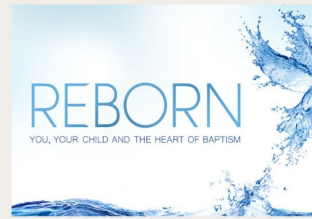
Reborn: You, Your Child and the Heart of Baptism

This beautiful documentary tells the story of Gregor Mendel, a scientist, Catholic priest, and scholar renowned as the founder of genetics.