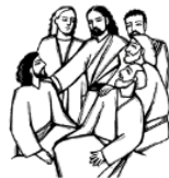
Calling the Twelve to him, he sent them out two by two. Mark 6:7 (NIV)

These were his instructions: "Take nothing for the journey except a staff—no bread, no bag, no money in your belts. Mark 6:8 (NIV)